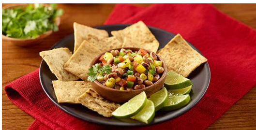
Greek Seven Layer Dip Texas Caviar